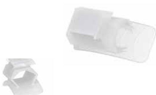
Adjustable forehead pad